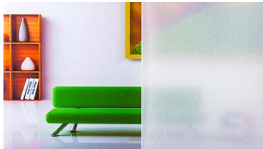
5 MST-5011 Washi

Mist-like embossed pattern featuring lower level of obscurity compared to MST-5002