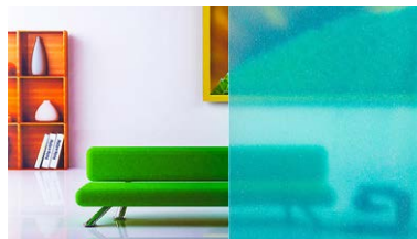
5 MSV-1004 Pearl Green