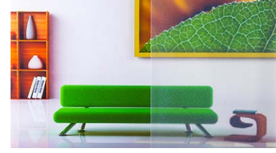
4 MST-5003 Fine Mist

Reduced obscurity compared to MST-5001; lowest white frost effect