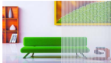
6 MST-5021 White Pleats

Expresses the beauty of Japanese paper; for applications requiring a calming effect