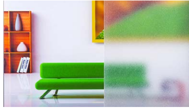
2 MSV-1002 Middle Matt