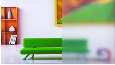
1 MSV-1001 Matt